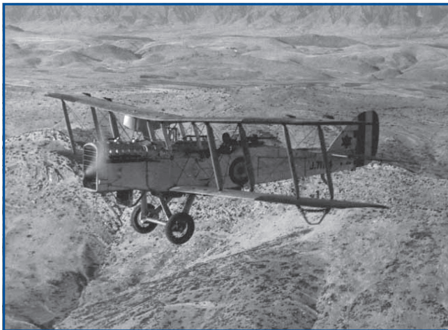
Iraq: Ninak (bi-plane) in flight, 1924