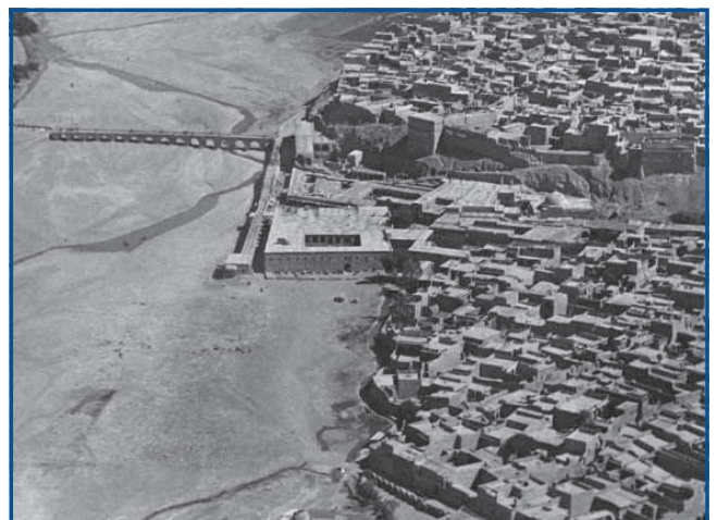
Kirkuk, Iraq, 1924 (aerial view)

This digital archive is an essential research tool for academic researchers in Middle East Studies, Conflict Studies, International Politics, Intelligence, History of Iraq, History of Islam and the State, Economic History (the Oil Industry), Politics, Government Studies, History of World Communism and Colonial History.