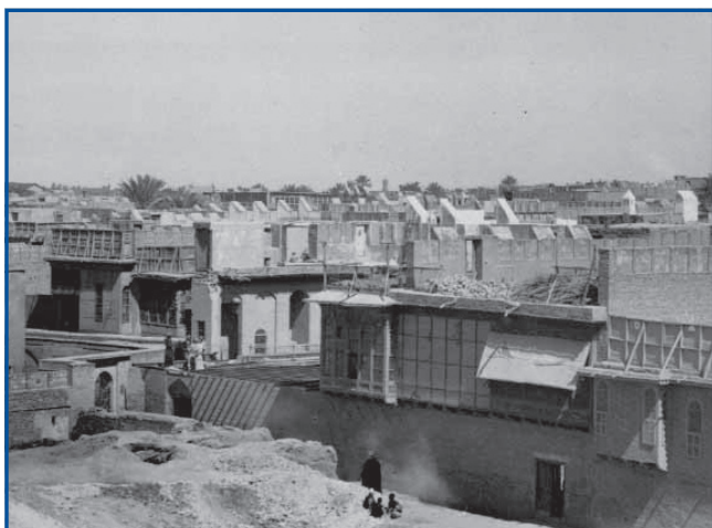
Iraq, Baghdad 1924