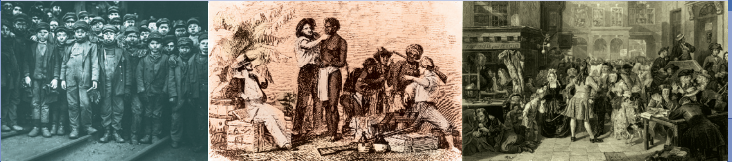
Images from L-R: 1. Coalminers, 2. Images of slavery, 3. Discussion of 'The South - Sea Bubble' - a noteworthy stock market scandal surrounding the South Sea Company's rise & fall prior to 1720.

"This is a highly usable, content-rich resource. Summing Up: Highly recommended." – Choice, March 2006